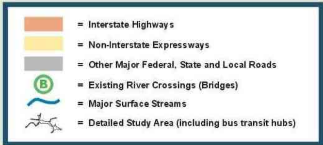
Figure 1.5: Existing Highway Network Tier 1 Draft Environmental Impact Statement Eastern Corridor Multi-Modal Projects Hamilton and Clermont Counties, Ohio

Hamilton County • Clermont County Ohio Department of Transportation City of Cincinnati • SORTA/Metro OKI Regional Council of Governments